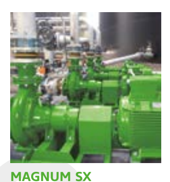
Thick matter pump gear and pedestal pump