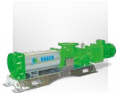
HELIX DRIVE Eccentric screw pump