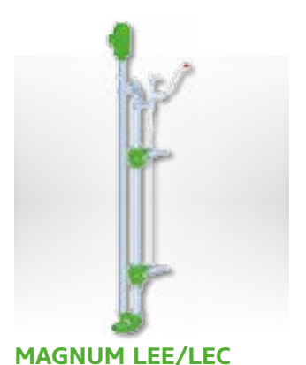
Long shaft pump