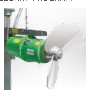
MSXH Submersible motor mixer