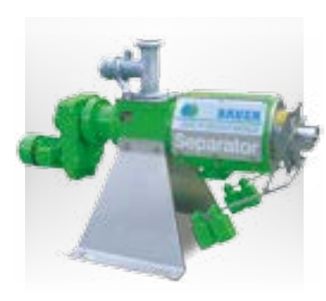
SEPARATOR Press screw separator for solid-liquid separation