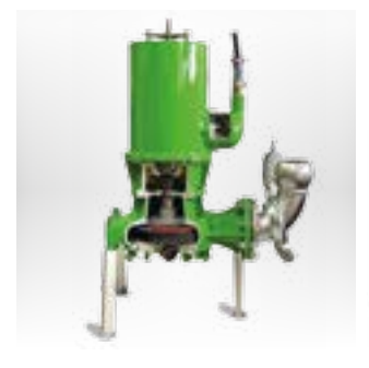
MAGNUM CSPH Submersible motor pump gear unit design