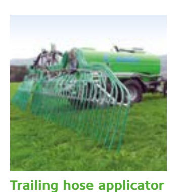
Modular system for all types of tankers