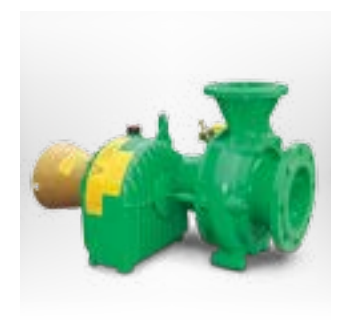
MAGNUM SM Thick matter pump gear unit design