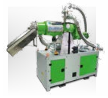
SEPARATOR PLUG & PLAY System for portable slurry separation