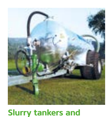
polyester tanker Different tanker types for every requirement