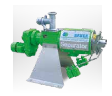
SEPARATOR Press screw separator for solid-liquid separation