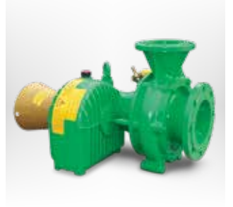
MAGNUM SM Thick matter pump gear unit design