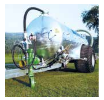
Slurry tankers and polytanker Different tanker types for every requirement