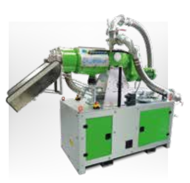
SEPARATOR PLUG & PLAY System for portable slurry separation