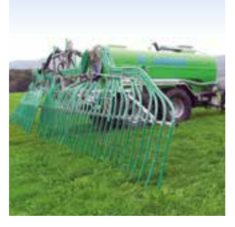
Trailing hose applicator Modular system for all types of tankers