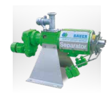
SEPARATOR Press screw separator for solid-liquid separation