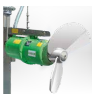
MSXH Submersible motor mixer