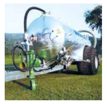
Slurry tankers and polyester tanker Different tanker types for every requirement