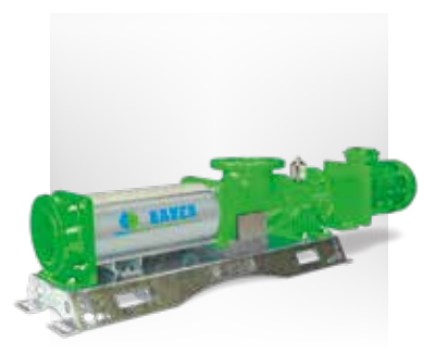
HELIX DRIVE Eccentric screw pump