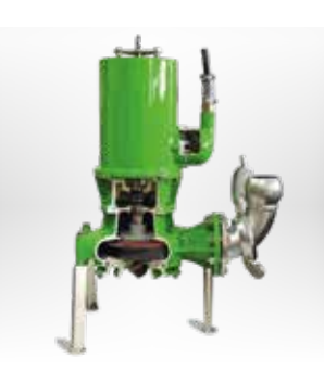
MAGNUM CSPH Submersible motor pump gear unit design