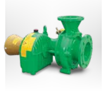
MAGNUM SM Thick matter pump gear unit design